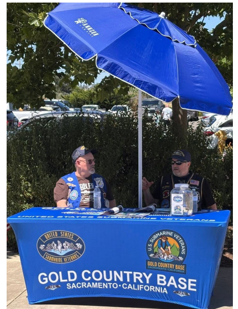
Memorial Day at Bass Pro and Mather VA Medical Center