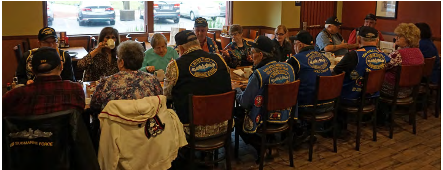
Great turnout for January First Call to Morning Chow

Our purpose is "Perpetuate the memory of our shipmates who gave their lives in the pursuit of their duties while serving their country. That their dedication, deeds and supreme sacrifice be a constant source of motivation toward greater accomplishments. Pledge loyalty and patriotism to the United States of America and its Constitution."