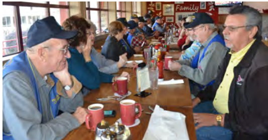
Attendance at First Call to Morning Chow continues to grow

Our purpose is "Perpetuate the memory of our shipmates who gave their lives in the pursuit of their duties while serving their country. That their dedication, deeds and supreme sacrifice be a constant source of motivation toward greater accomplishments. Pledge loyalty and patriotism to the United States of America and its Constitution."