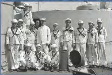
Navy Uniform Regulation 3501.27

In 1886, a "low rolled brim high-domed item of constructed of canvas" is written into regulations.