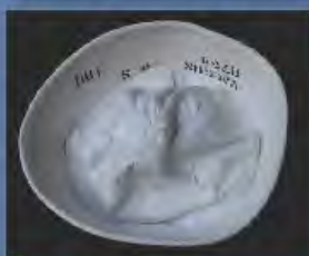
Navy Uniform Regulation 3501.27

The hat "Must be made of white cotton twill with a rounded crown and full stitch brim.