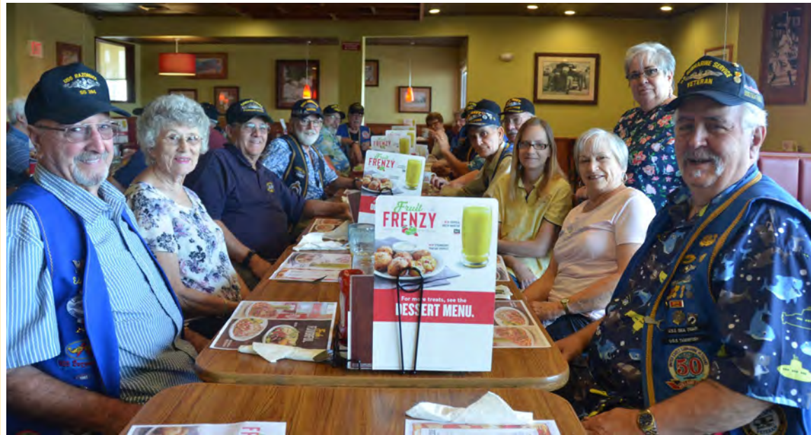
First Call to Morning Chow Great Turn-Out

Our purpose is "Perpetuate the memory of our shipmates who gave their lives in the pursuit of their duties while serving their country. That their dedication, deeds and supreme sacrifice be a constant source of motivation toward greater accomplishments. Pledge loyalty and patriotism to the United States of America and its Constitution.