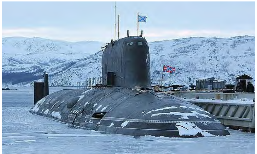
The Severodvinsk is thought to be the most powerful multipurpose submarines in the Russian navy, armed with 24 cruise missiles and with a top speed of up to 35 knots

The Russian attack boat was under construction since 1993 before it began sea trials in 2011 and then fully operation in 2014.