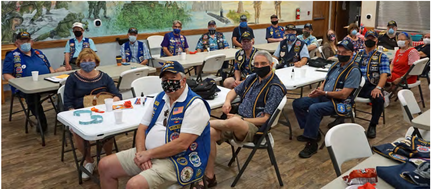
Great Turn Out For Our June Meeting—Everyone is Smiling

Our purpose is "Perpetuate the memory of our shipmates who gave their lives in the pursuit of their duties while serving their country. That their dedication, deeds and supreme sacrifice be a constant source of motivation toward greater accomplishments. Pledge loyalty and patriotism to the United States of America and its Constitution."