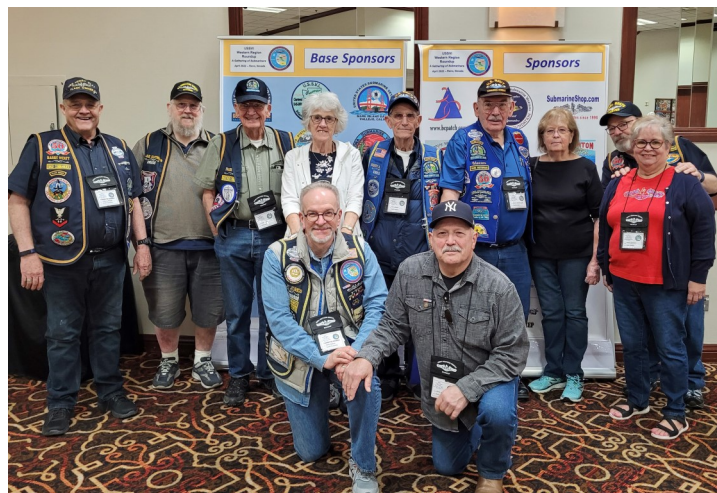
Gold Country showed up in force (not pictured Joel Walton)