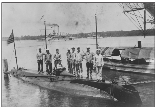
The crew of the USS Holland (SS-1) stands atop the submarine while moored at the U.S. Naval Academy in 1903.