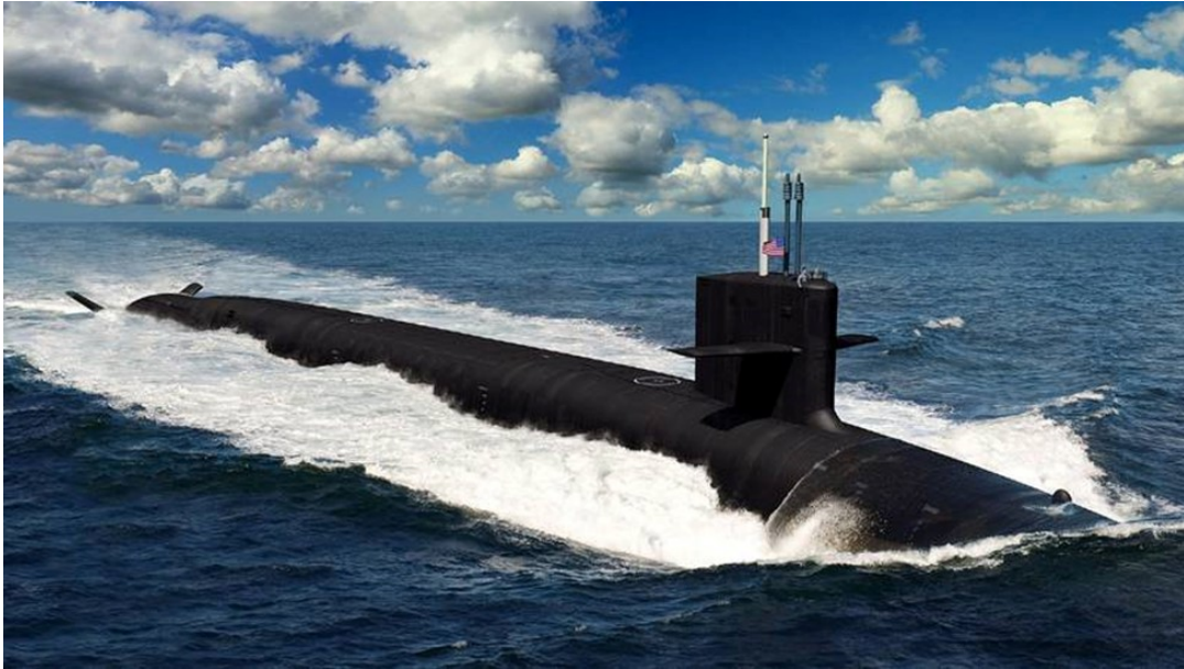
An artist's rendering of the U.S. Navy's next-generation Columbia-class submarine

A workforce training program in eastern Connecticut has doubled the number of classes of prospective employees of Electric Boat and its suppliers facing U.S. Navy deadlines to manufacture a rising number of submarines, particularly the next-generation Columbia class that's a top military priority.