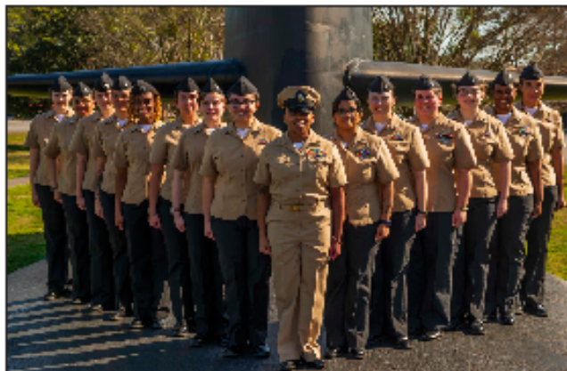
The enlisted women assigned to the Blue Crew of the Ohio-class ballistic-missile submarine USS Wyoming (SSBN 742).

"As I learn more about women's history, it brings me so much