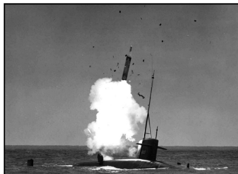
USS Henry Clay (SSBN 625) launches a Polaris Missile from the surface of the Atlantic Ocean off Cape Kennedy in 1964.