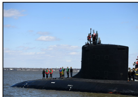
The Virginia-class submarine USS Delaware (SSN 791) is guided by a tugboat as it arrives in Wilmington, Delaware March 29, 2022. Delaware's 132-man crew transited to Wilmington to participate in week-long commemoration events in honor of the boat's commissioning ceremony.