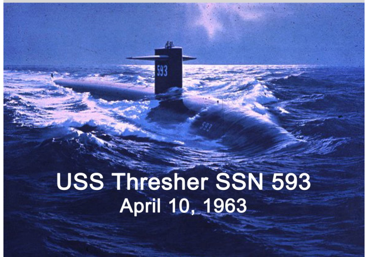
USS Thresher SSN 593 April 10, 1963